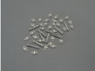
31267 connection kit 10x38, 2-pole for 10 2-pole combinations 10x38