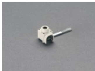
31103 connecting terminal, side connection for comb type busbars pitch 18 mm