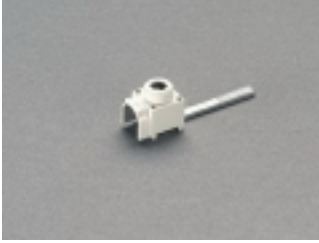
31157 connecting terminal, front connection for comb type busbars pitch 18 mm