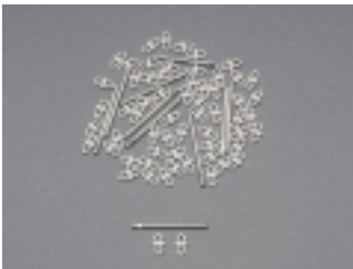
31268 connection kit 10x38, 3-pole for 10 3-pole combinations 10x38