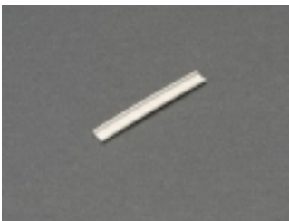
31939 label for AES 100x 10 pcs.